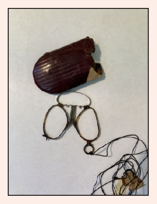
C-Spring oval pince-nez tortoiseshell spectacles ( 3" \times 1.75" ) with leather and cardboard case, late 19th century.

Insert: Folding C_Spring gold metal spectacles (3" \times 1.75") with leather metal trimmed case. Late 19th century